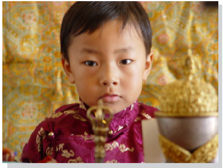
The newly recognized reincarnation of Tulku Urgyen Rinpoche, Urgyen Jigme Rabsel