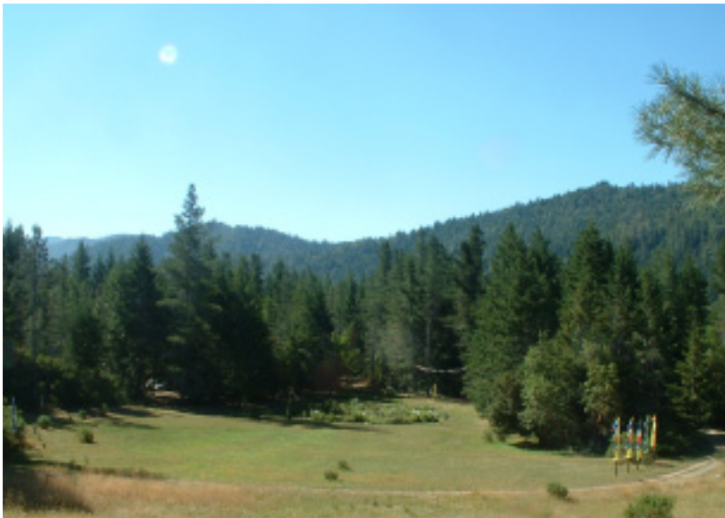
View from future temple site

The dharma is that which can improve, which can help to change the wild, the untamed, the hardened character of us humans -- the wild emotions: the conceit, the pride, the jealousy, the selfishness. Such emotions make people savage and unkind. They make ourselves unhappy, and they make others unhappy. But when we can change and improve ourselves, our own minds, our own hearts, we can make both ourselves and also others at ease. So the real