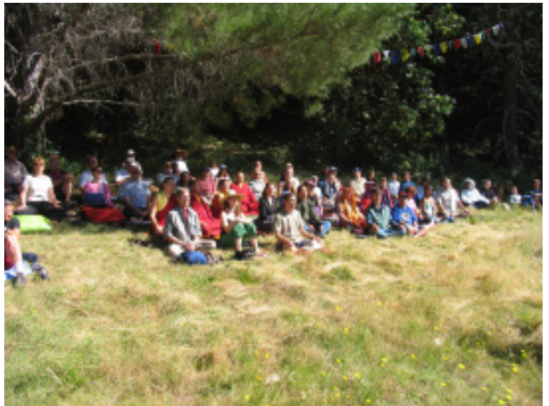
Group meditation in the meadow with Chokyi Nyima Rinpoche, July, 2006

It rarely happens that someone achieves the exact and unmistakable knowledge resulting from meditation training without some basis of learning and reflection. Therefore it is my deep-felt wish and aspiration to create a learning center in which study, reflection, and meditation training are practiced hand in hand. A learning center is the support for the teachings of Lord Buddha and for the happiness and welfare of sentient beings. For people who wish to do in-depth studies of both the sutra and tantric systems, the most conducive environment is that of a center for Buddhist studies. Without such a facility, in-depth studies rarely happen.