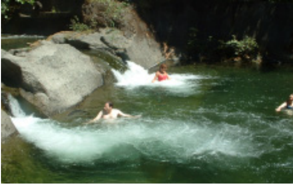
Cooling off in Cedar Creek, Summer, 2005