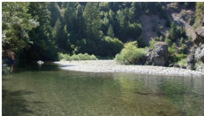
at the river