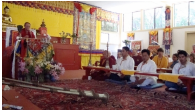
at the Ngakso Puja