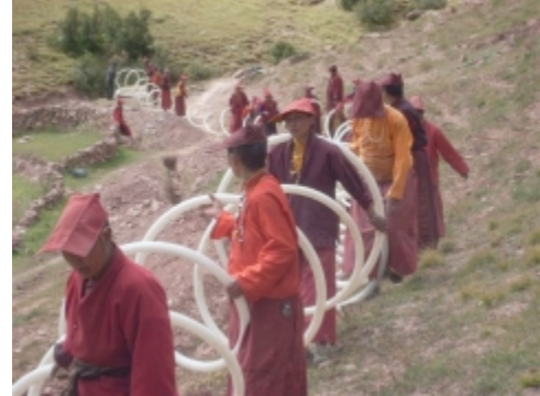
Nuns at Dechen Ling laying water pipe

In 2009 we look forward to building another clinic at Neten Monastery with support from The Bridge Fund. This will be our fourth fully funded clinic. Three more are planned, as well as an expansion of the existing clinic at Cha Chik. Yangdzom's medical and support team will travel to Nangchen next year to oversee activities.