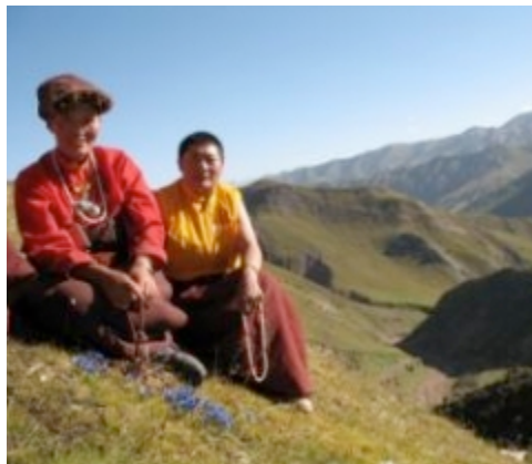
Nuns at Cha Chik in Eastern Tibet